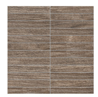
1 x 6 Stacked Mosaics (available in all colors)