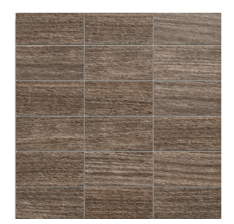
2 x 4 Stacked Mosaics (available in all colors)