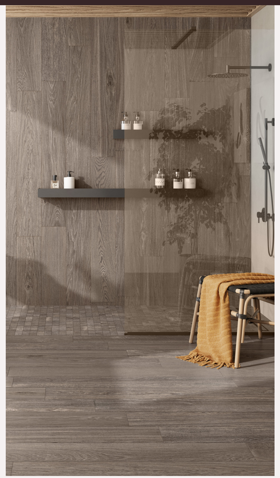
Floor: RR84405 > Tea Time 8 x 48 UPS and