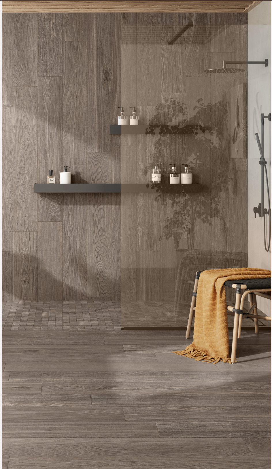
Floor: RR84405 ▶ Tea Time 8 x 48 UPS and