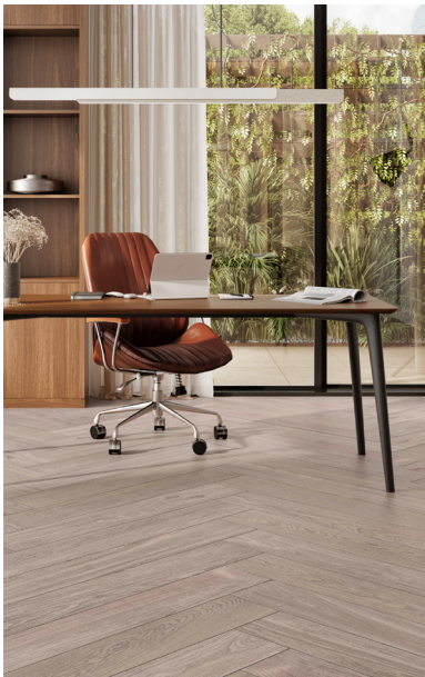
Floor: RR84403 ▶ Welcoming Dawn 8 x 48 UPS

©2024 AHF, LLC. All trademarks are owned by AHF, LLC, or its subsidiaries or affiliates. | Printed in USA. | NOTE: Due to printing limitations, colors pictured cannot be guaranteed to match actual material.