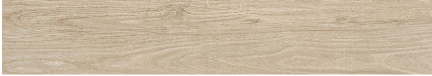
RR84401 ▶ Morning Light