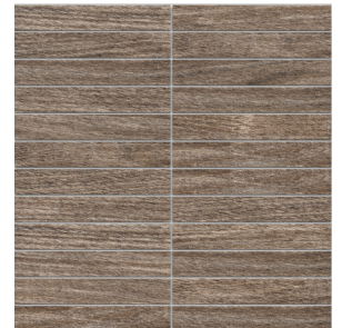
1 x 6 Stacked Mosaics (available in all colors)