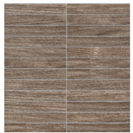
1 x 6 Stacked Mosaic Mounted on a 297 x 290 sheet