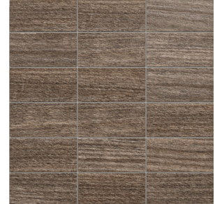
2 x 4 Stacked Mosaics (available in all colors)