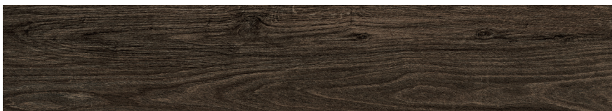
RR84409 ▶ Nightfall