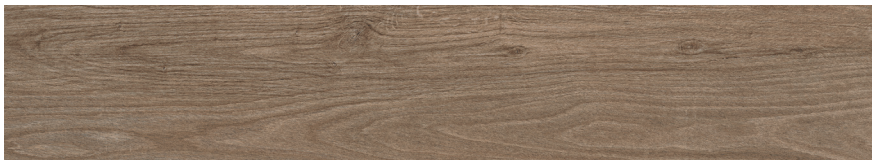
RR84405 ▶ Tea Time