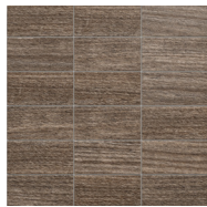
2 x 4 Stacked Mosaic Mounted on a 297 x 297 sheet