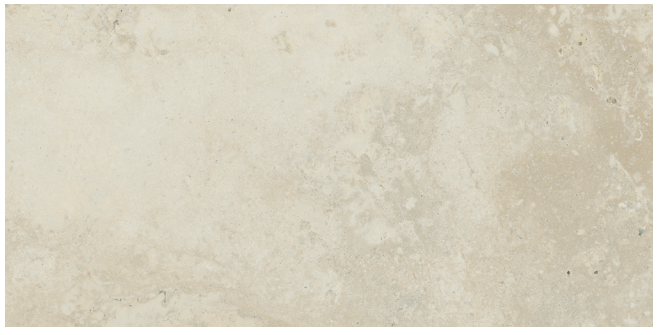
ST24418 ▶ Travertine Ivory Coast