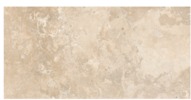
ST24421 ▶ Travertine Sandcastle