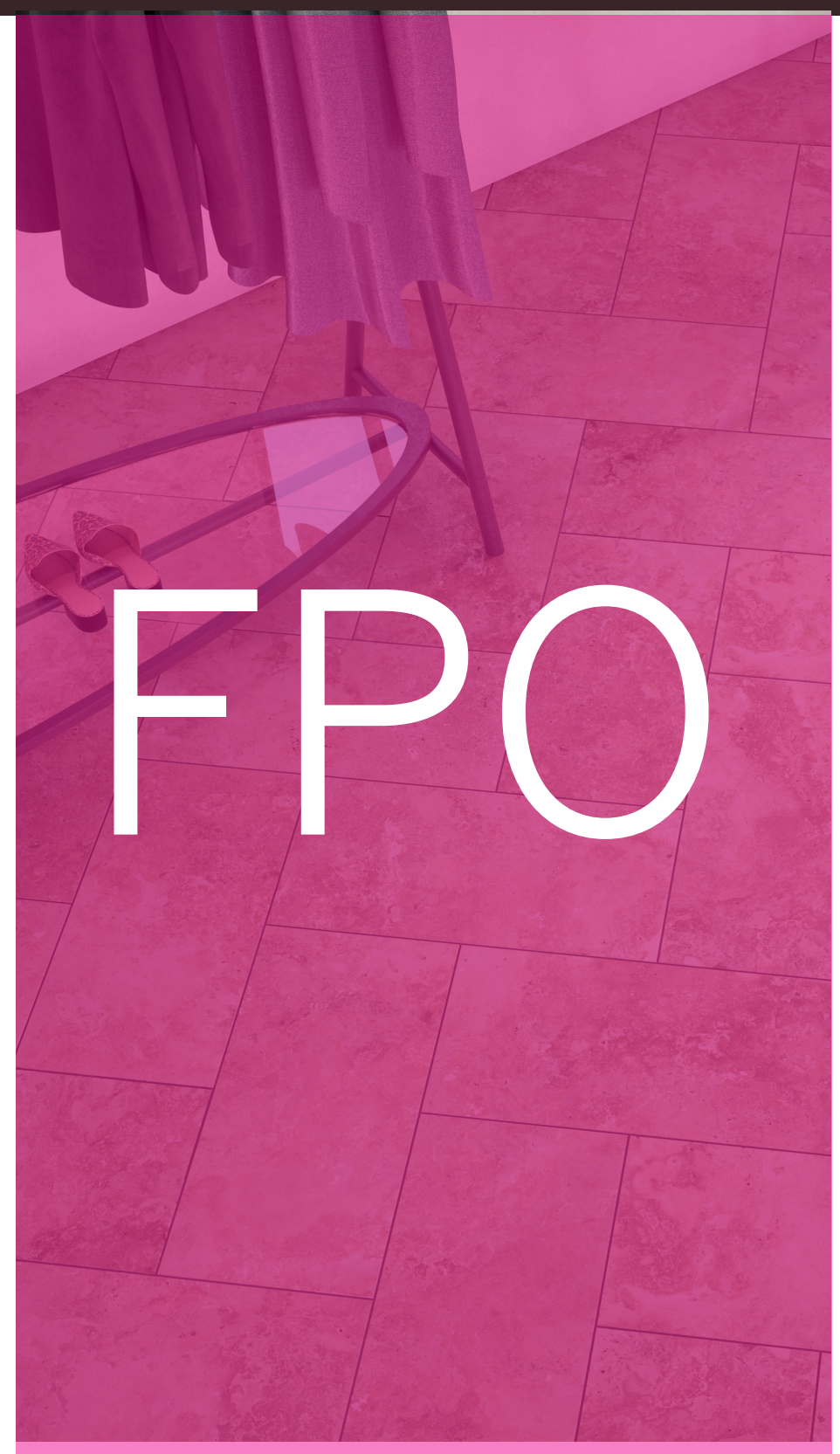
Floor: STF04 Travertine Coffee 12 x 24 UPS