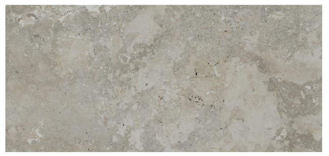
ST24424 ▶ Travertine Hazy Day