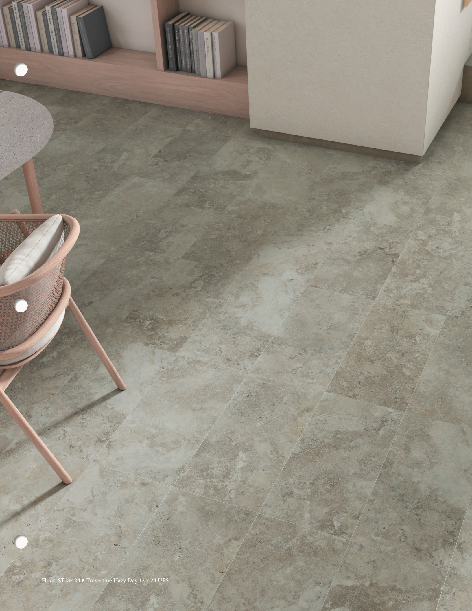
Floor: ST24424 ▶ Travertine Hazy Day 12 x 24 UPS