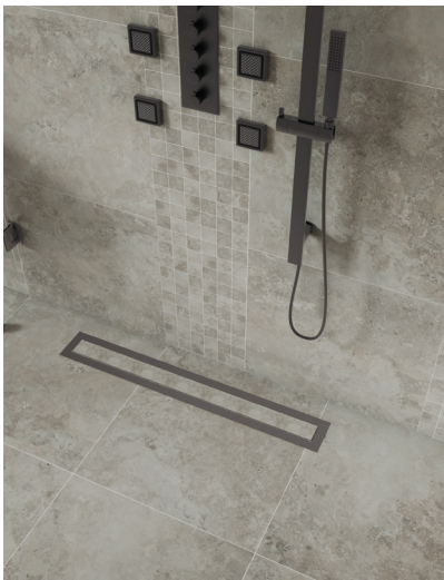
Floor: ST24424 ▶ Travertine Hazy Day 24 x 24 EXT