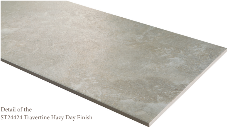
Detail of the ST24424 Travertine Hazy Day Finish