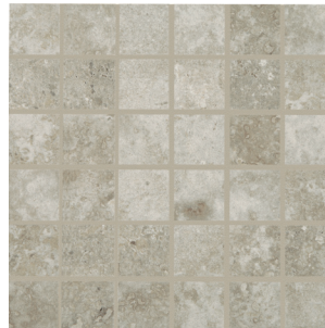
STF03.10202MOS ▶ Travertine Hazy Day 2 x 2 Mosaic