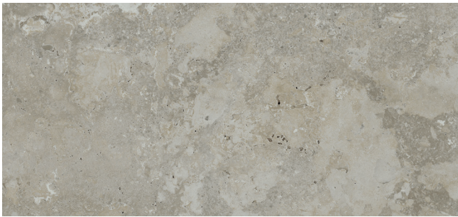
ST24424 ▶ Travertine Hazy Day