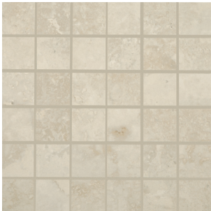
STF01.10202MOS ▶ Travertine Ivory Coast 2 x 2 Mosaic