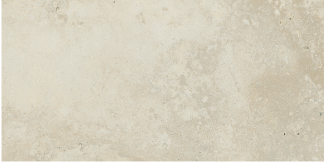
ST24418 ▶ Travertine Ivory Coast