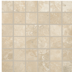
STF02.10202MOS ▶ Travertine Sandcastle 2 x 2 Mosaic