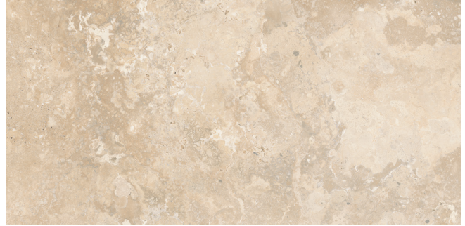
ST24421 ▶ Travertine Sandcastle