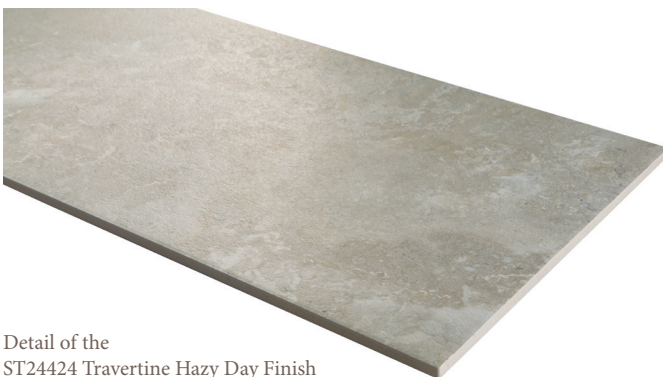
Detail of the ST24424 Travertine Hazy Day Finish