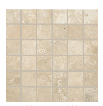
STF02.10202MOS ▶ Travertine Sandcastle 2 x 2 Mosaic