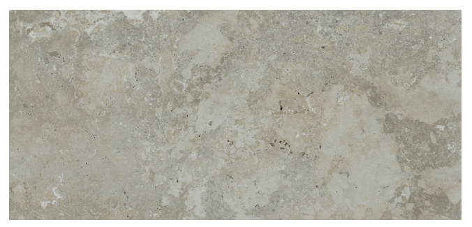
ST24424 ▶ Travertine Hazy Day