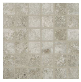
STF03.10202MOS ► Travertine Hazy Day 2 x 2 Mosaic