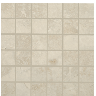
STF01.10202MOS ► Travertine Ivory Coast 2 x 2 Mosaic