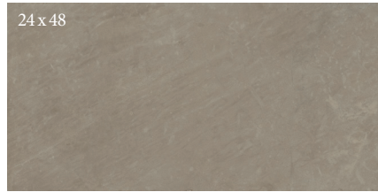
24 x 48