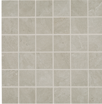
PTG03.10202UMOS ▶ Castelo Fog (Cool Mid) 2 x 2 Mosaic