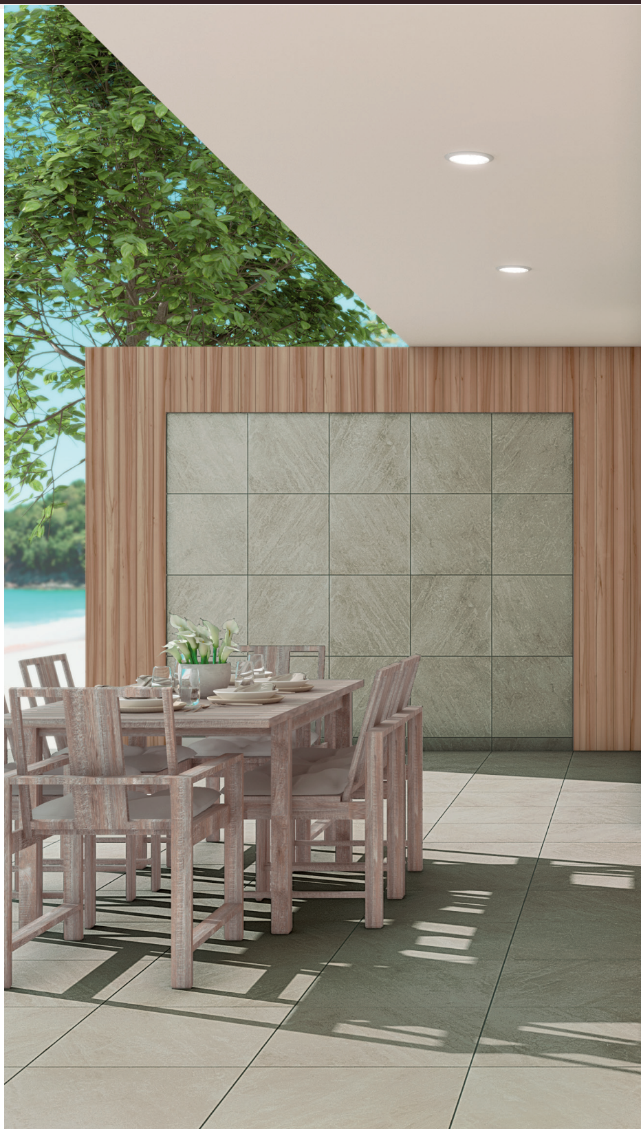
PT22454 ▶ Castelo Fog 24 x 24 EXT