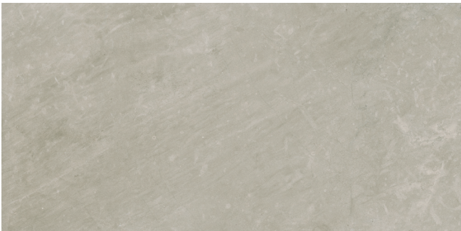
PT22453 ▶ Castelo Fog