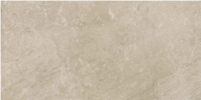
PT22448 ▶ Blushing Rosé