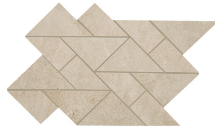
PTG02.1CRSUMOS ▶ Blushing Rosé (Warm Light) Geometric Mosaic†