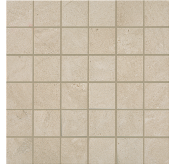
PTG02.10202UMOS ▶ Blushing Rosé (Warm Light) 2 x 2 Mosaic