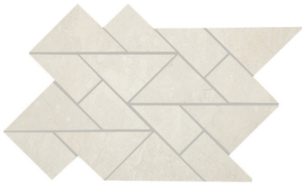
PTG01.1CRSUMOS ▶ Classica White (Cool Light) Geometric Mosaic†