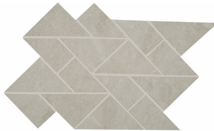
PTG03.1CRSUMOS ▶ Castelo Fog (Cool Mid) Geometric Mosaic†