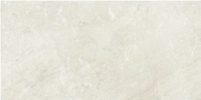
PT22443 ▶ Clássica White