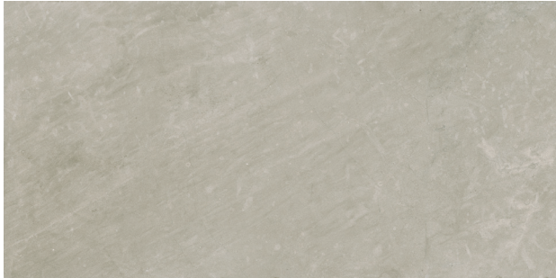
PT22453 ▶ Castelo Fog