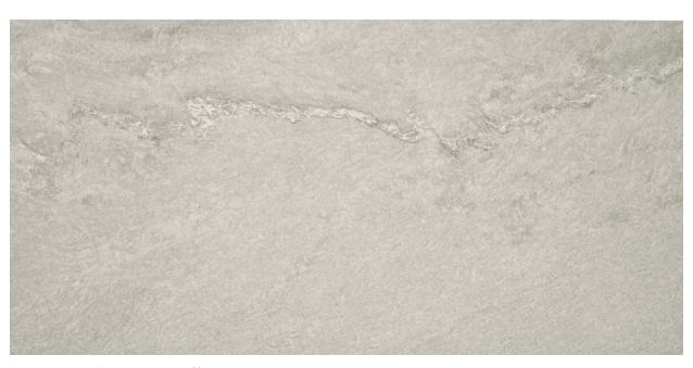
OS24428 ▶ Snow Fall