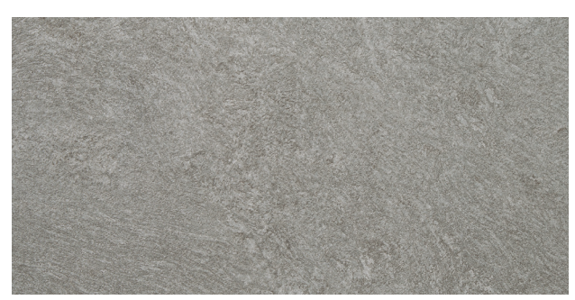
OS24433 ▶ Silver Lining