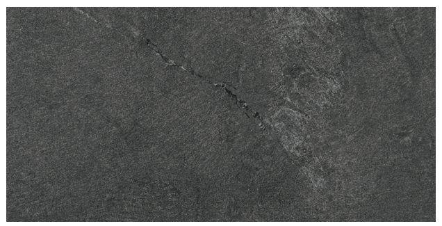
OS22438 ▶ Raven Wing