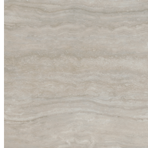
WB12411 ▶ Travertine Mist