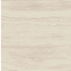
WB12409 ▶ Travertine Frost