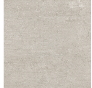
WB12407 ▶ Concrete Mist