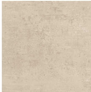
WB12406 ▶ Concrete Café Au Lait