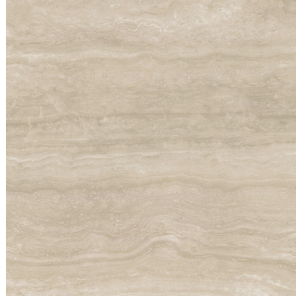
WB12410 ▶ Travertine Café Au Lait