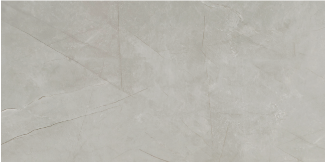
SA24466 ▶ Valle Invernale