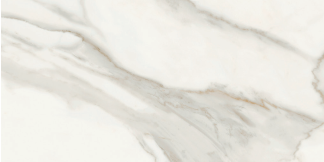
SA24462 ▶ Mattina D'Oro