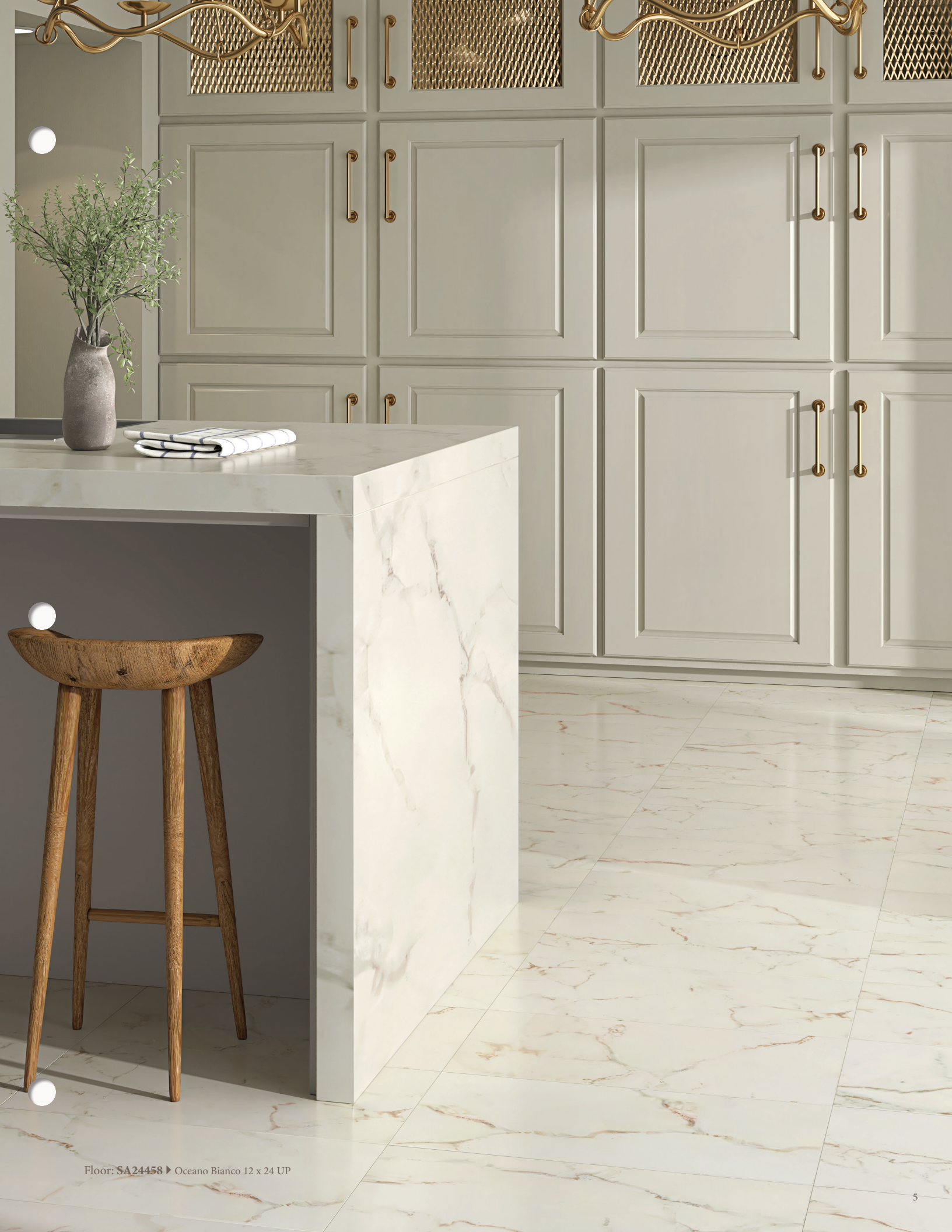
Floor: SA24458 ▶ Oceano Bianco 12 x 24 UP