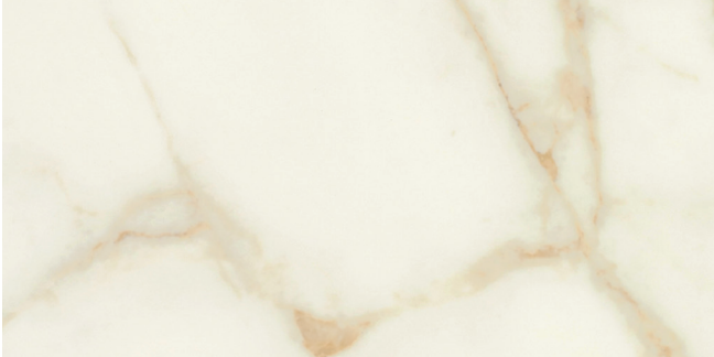
SA24458 ▶ Oceano Bianco