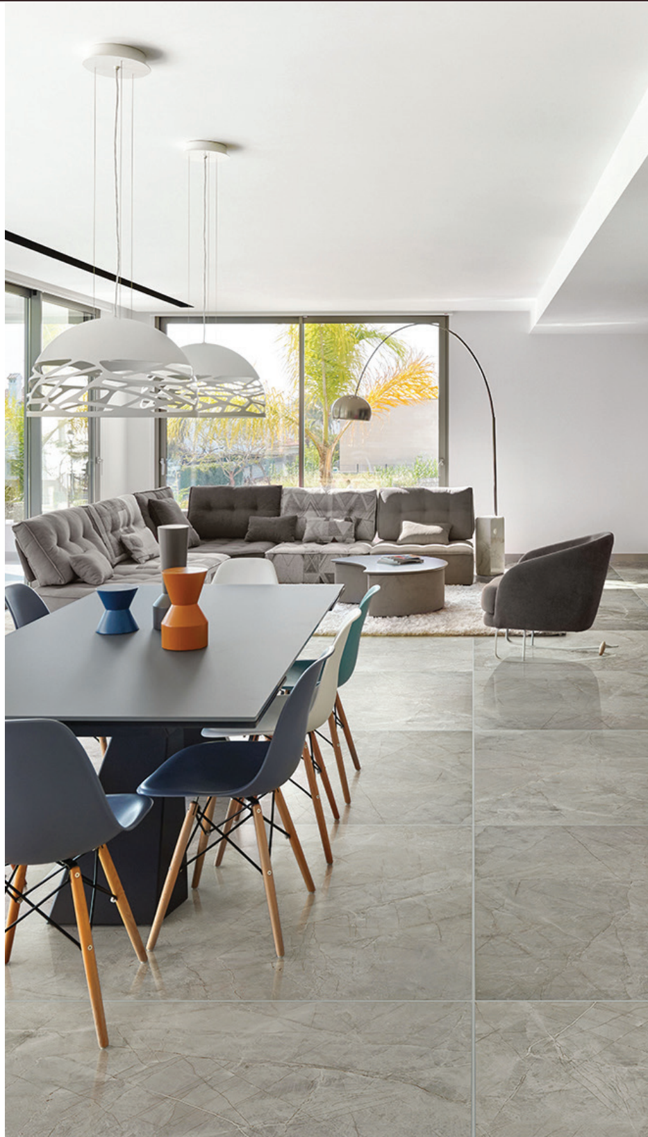
SA12465 ▶ Valle Invernale 48 x 48 PO