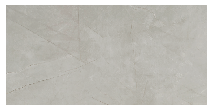
SA24458 ▶ Oceano Bianco