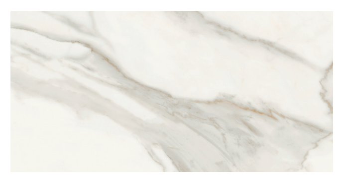
SA24462 ▶ Mattina D'Oro