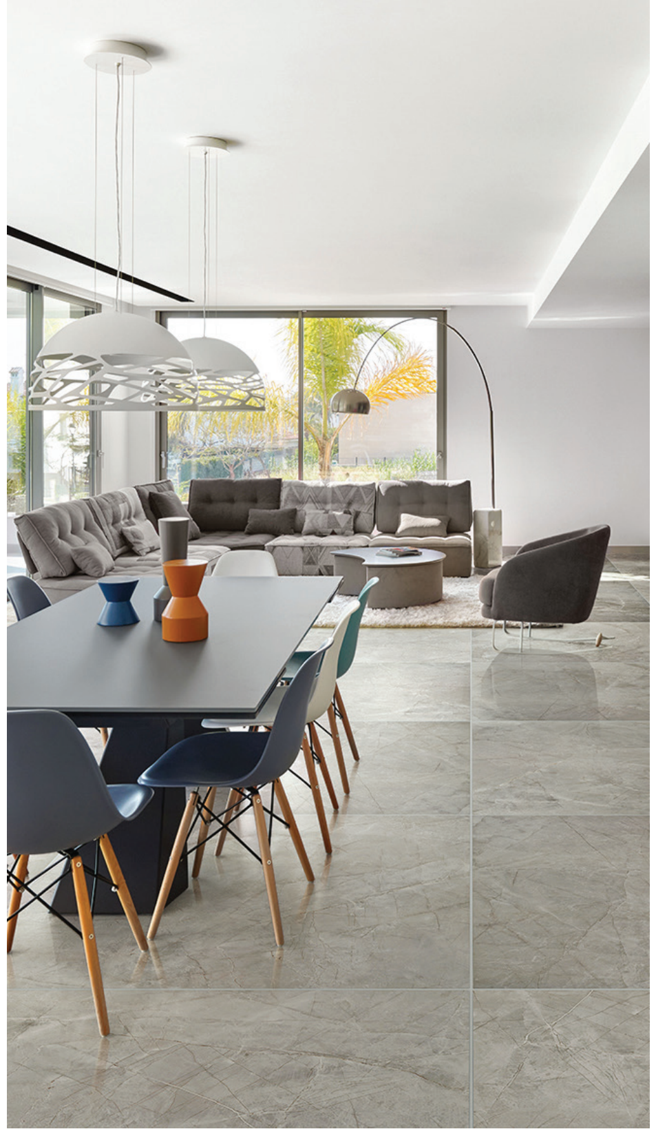
SA12465 ▶ Valle Invernale 48 x 48 PO